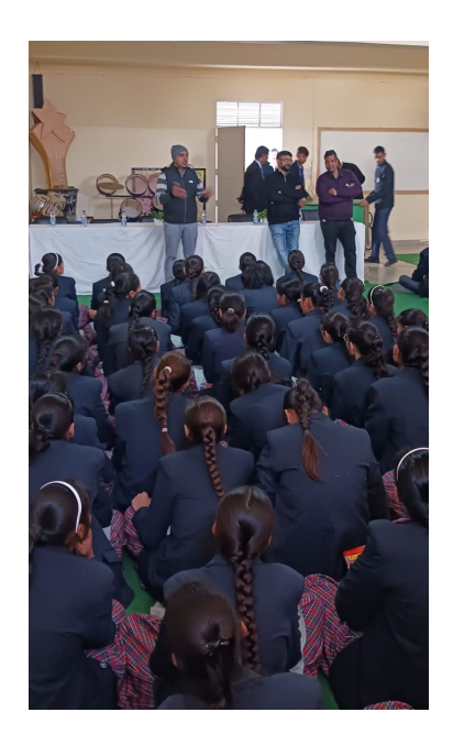
Interaction Session at Growell School Girl Wing Baraut