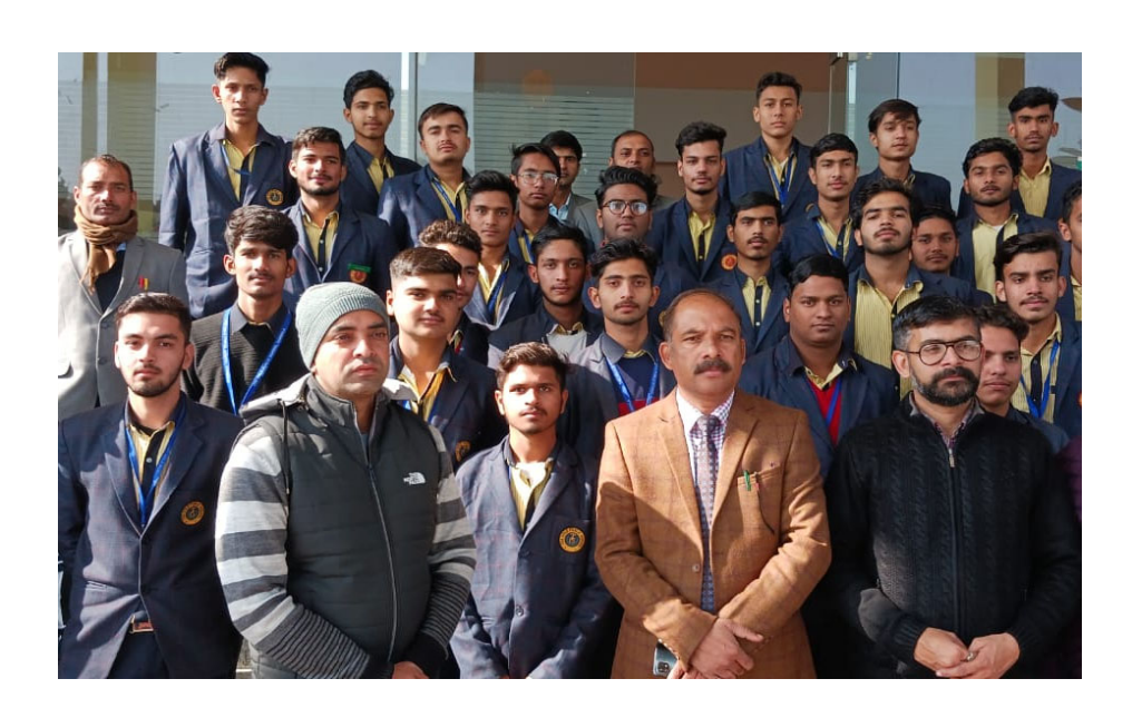
Interaction Session at Jai Parvati Global School, Ramala